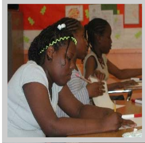
Planting the seeds of knowledge