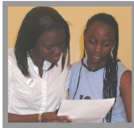
“Empowering Girls with the Power of Choice”