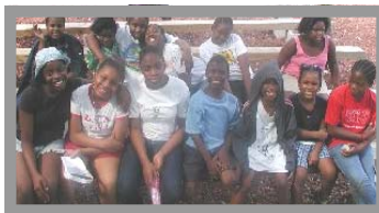
Peer Group Bonding